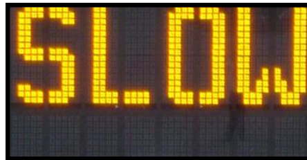
23 " Characters